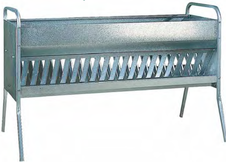
Plate rack for sheep

Code 50501 – Rack that is 2 m long for sheep. Completely made of galvanized plate. With a high-capacity tray that allows adding cereals and leguminous plants to the forage. Collapsible model.